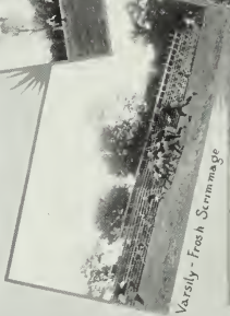
Varsity - Fresh Scrimmage